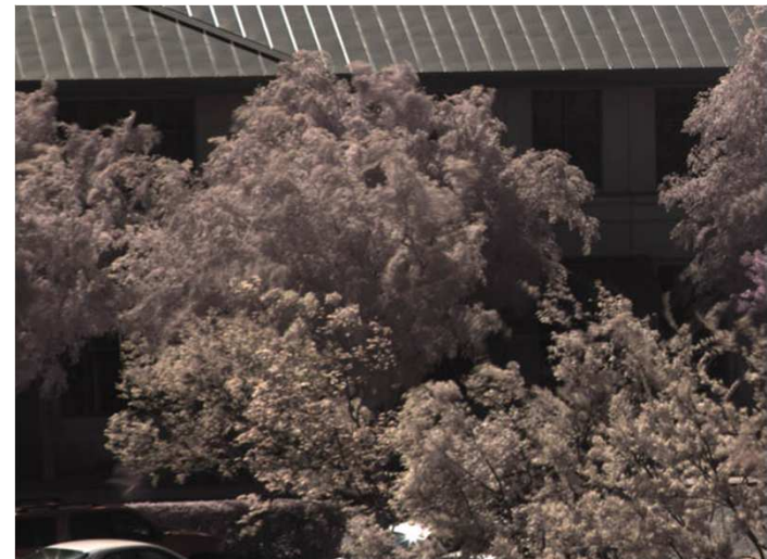
No IR Cut filter used