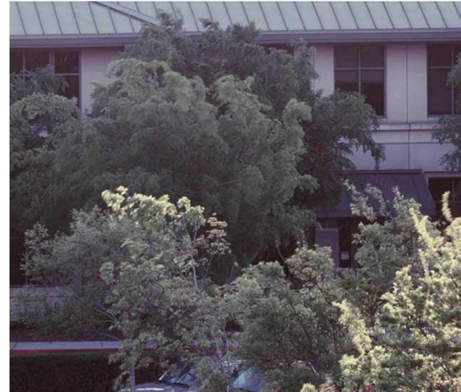
IR Cut filter used